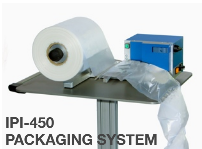
IPI-450 PACKAGING SYSTEM